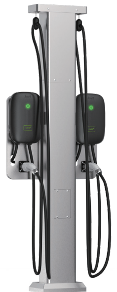
Dual side-to-side cable management system